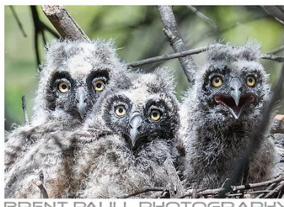
Long-eared Owl Nestlings - Morongo Bird Safari

Did you miss a previous program, or just want to re-visit one of them? We have links to recordings of past VAS speaker presentations on our "Monthly Speakers" web page