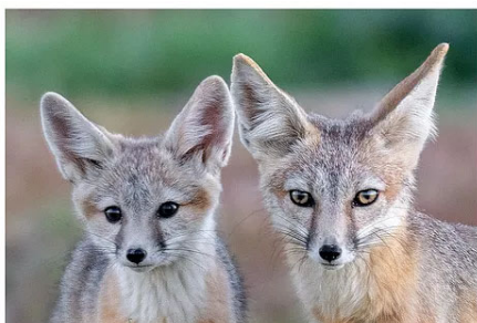
Desert Kit Fox Vixen and Puppy - Kit Fox Safari

children) have all spent time exploring the vast reaches of the American West.